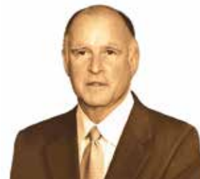
Gov. Jerry Brown (D)

— Gov. Jerry Brown, Jr., signing AB 1839 which increases the state’s film and television tax credit to $330 million a year for five years beginning with fiscal year 2015-16