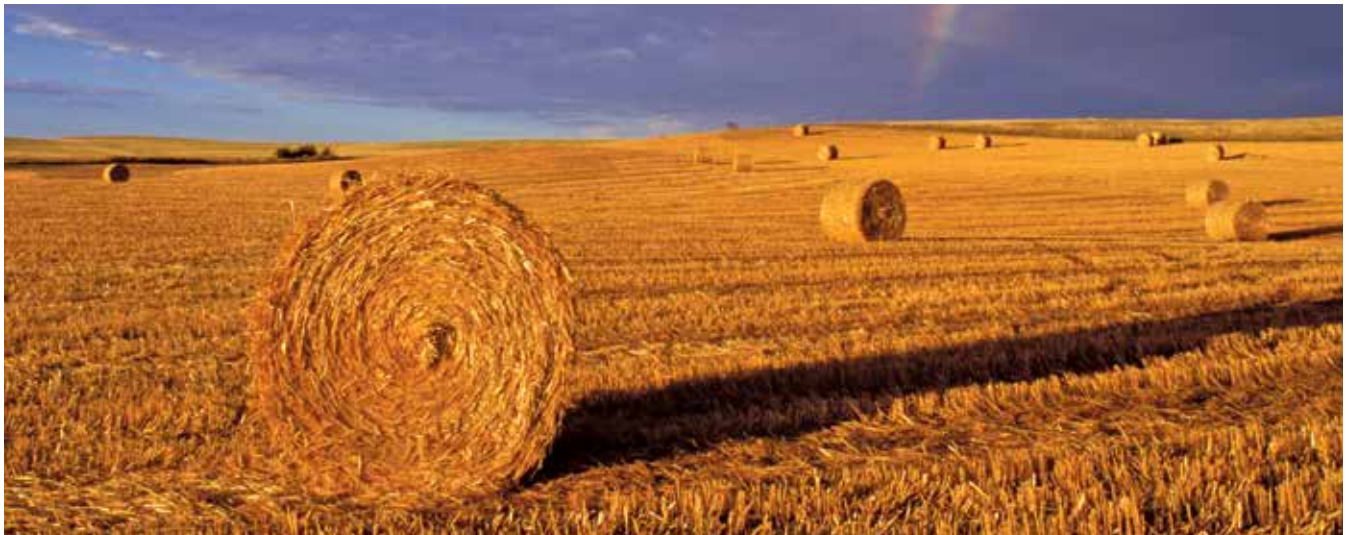
Billion-dollar fertilizer projects in North Dakota are seeking to unite bountiful natural gas from the state's oil patch with the state's traditionally bountiful crops.

MF = Manufacturing OF = Office HQ = Headquarters DW = Distribution/Warehouse