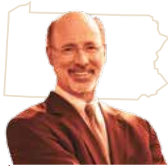
Gov. Tom Wolf (D)

— Gov. Tom Wolf, May 18, 2015, on the occasion of the Pennsylvania Dept. of Community and Economic Development being awarded the 2015 President’s “E Star” Award for Export Service