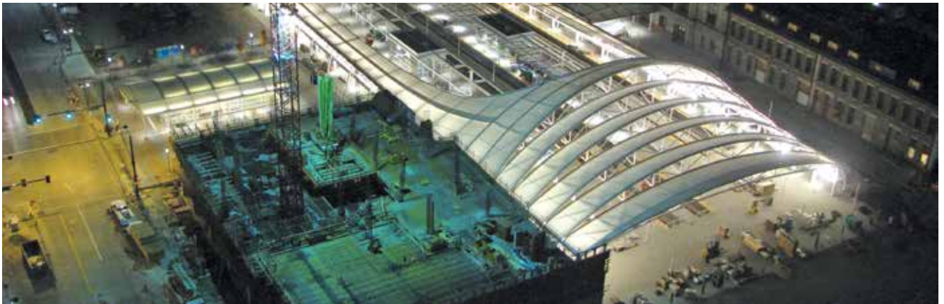
Denver Union Station Canopy

MF = Manufacturing OF = Office HQ = Headquarters RD = Research & Development DW = Distribution/Warehouse