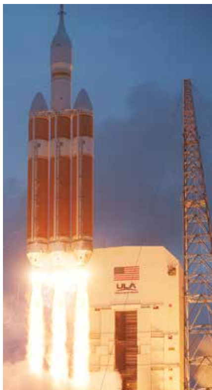
A Delta IV Heavy rocket lifts off from Space Launch Complex 37 at Cape Canaveral Air Force Station in Florida in early December 2014 carrying NASA’s Orion spacecraft on a successful unpowered flight test to Earth orbit.