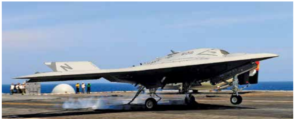
A Northrop Grumman X-47B landing.

Baltimore ranks 10th among US metros in a Forbes ranking of cities creating the most technology jobs, based on the growth of tech industry employment and STEM occupation employment. Further, Baltimore/Washington, DC, ranks second among highest paying cities for tech jobs, also according to Forbes.