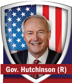
Gov. Hutchinson (R)

“By shifting the focus from student enrollment to student progression and accomplishment, we create a positive incentive for colleges and universities to encourage more students to complete their courses of study and for institutions to be more efficient in their operations.”