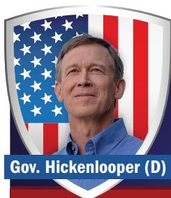
Gov. Hickenlooper (D)

"I think I can speak for the retail business community that the Broncos better start winning."