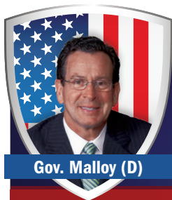
Gov. Malloy (D)

“Throughout our work, we’ve tried to play the long game for Connecticut, not doing what is politically expedient, but rather what we believe is in the best interests of the people we serve today, and for generations to come.”