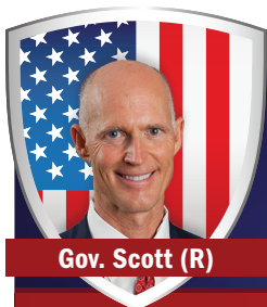
Gov. Scott (R)

"In six years and two months, we've added 1.3 million new jobs. It's very important we keep the effort up. We've got to keep marketing our state. If we don't, we're not going to get as many tourists, which will mean less jobs, and 1.4 million jobs are tied to tourism."