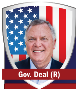
Gov. Deal (R)

“Our low tax burden and economic assets, including a robust workforce and unparalleled connectivity, lead the nation in attracting industry leaders from across the country and around the world.”