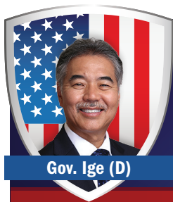
Gov. Ige (D)

“In many ways, the state of the State of Hawaii is sound and full of possibilities. Having said that, we all know there is still much work to be done. There are families out there that continue to struggle despite the overall state of the economy.”