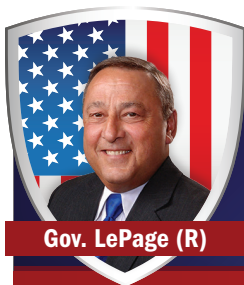
Gov. LePage (R)