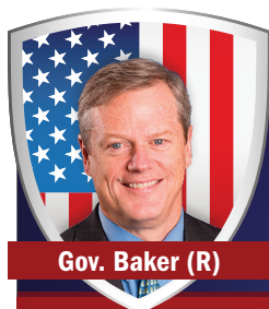
Gov. Baker (R)

“Advanced sensors, smart construction materials and adaptable clothing are just a few of the innovative products that will be developed in Massachusetts’ evolving manufacturing sector over the coming decades.”