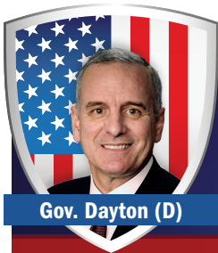
Gov. Dayton (D)

"The credit for our state's continued economic success belongs to the people of Minnesota. I thank the hardworking Minnesotans and business owners who have made Minnesota home to their families, innovative companies, and a great quality of life."