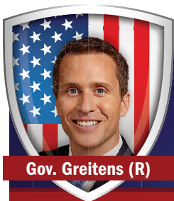
Gov. Greitens (R)

“People around the world are paying attention to what we are doing in Missouri. They are interested in buying our products and investing in job-creating businesses in our state. I’m proud to fight for Missouri jobs and Missouri businesses by promoting opportunities for our state overseas.”