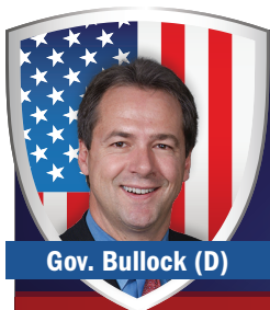
Gov. Bullock (D)

“We are one big town with a really long Main Street, we have the kindest people with a can-do attitude, the most spectacular public lands for all to enjoy, and a unique ingenuity that creates thriving businesses and a growing economy.”