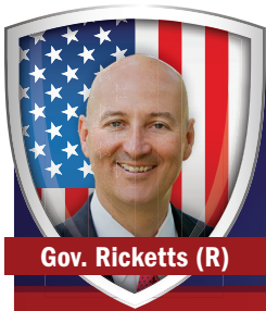
Gov. Ricketts (R)

“Kawasaki’s decision to expand operations in Nebraska demonstrates our competitive position in the global economy and the importance of international trade missions to bringing investment to Nebraska.”