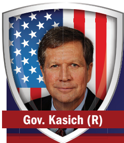
Gov. Kasich (R)

“When we begin to work together on local concerns we’ll begin to understand one another, respect one another, like one another and joke with one another again.”