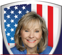
Gov. Fallin (R)

"The footprint of aviation and aerospace in our state has grown dramatically – 250 percent – in the more than 20 years since our last study."