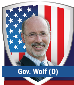
Gov. Wolf (D)

"The process of fully remediating a site can often be difficult and costly, so this program is vital to help get these sites pad-ready. Having a collection of former brownfield sites ready for occupation helps attract companies."