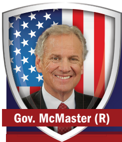
Gov. McMaster (R)

“Our ports system is one of the greatest assets we have in South Carolina that sets us apart, and with the construction phase of the Charleston harbor deepening project beginning, the number of opportunities for South Carolinians will continue to grow.”