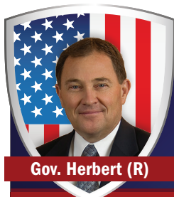
Gov. Herbert (R)