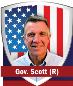
Gov. Scott (R)

“Our workforce is shrinking and this demographic issue is clearly of concern to the rating agencies, to me and my team. Reversing it should be the top priority of every elected official, regardless of party or philosophy.”