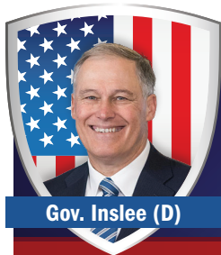
Gov. Inslee (D)

“Today, I am here with the hope that together we will usher in a new era – one that moves past polluting fossil fuels and embraces a clean-energy future. There is no doubt in my mind that clean-energy technologies open doors to economic prosperity.”