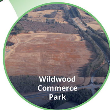
Wildwood Commerce Park

Customized Machine Technology & Engineering Programs