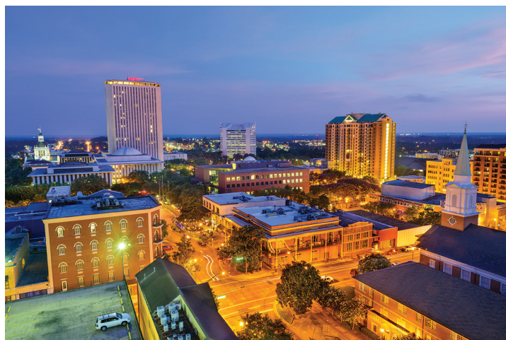
Tallahassee, Florida