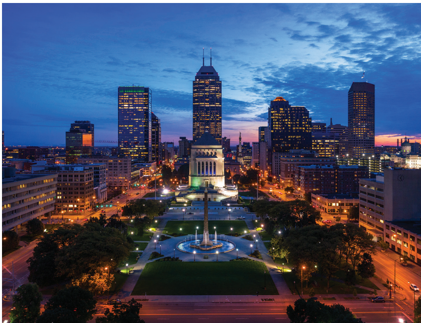
Indianapolis, Indiana

As of August 20, 2020, Indiana had either already spent or committed to spending about $1.7 billion of its $2.4 billion in CARES Act funding. Expenditures included $200 million to the Indiana State Health Department for COVID testing and contact tracing costs; $150 million to the Indiana Family and Social Services Administration for residential and home health providers, nursing facilities, safe recovery sites and operational costs; $25 million for the Workforce Ready Grant Program and Employer Training Grant Program; and $44 million to the Indiana Economic Development Corp. for the personal protective equipment marketplace and small business grant program. Indiana's Manufacturing Readiness Grants are designed to stimulate manufacturing investments during the pandemic, with an emphasis on the manufacturing of personal protective equipment, testing supplies and vaccines. Gov. Holcomb hopes to expand the program during the 2021 legislative session.