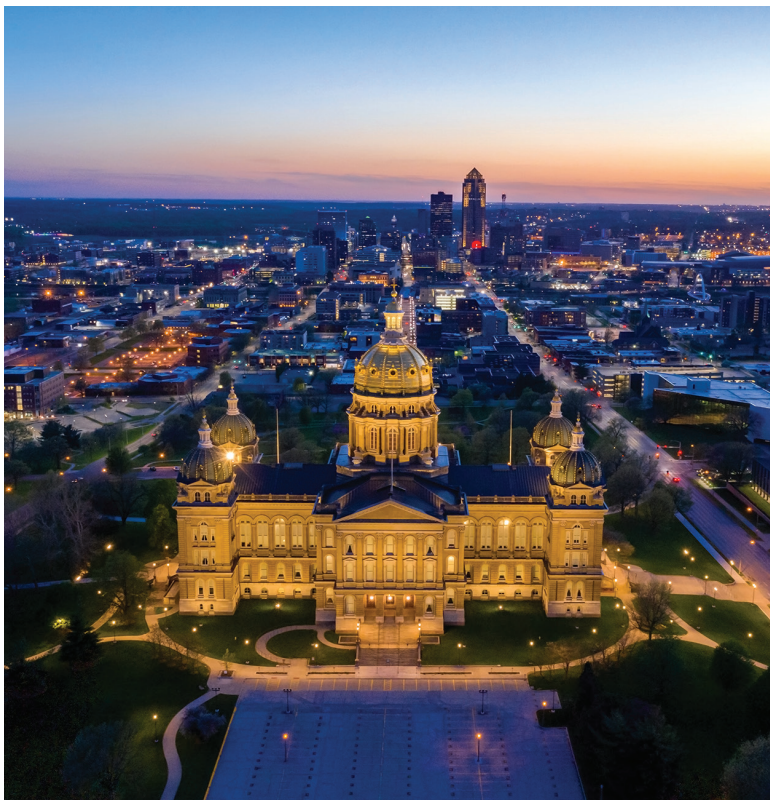
Des Moines, Iowa

The following is a synopsis of the actions, support or resources the Iowa Economic Development/ Iowa Finance Authority (IEDA/IFA) has undertaken or made available in response to the COVID-19 crisis. Information on all resources can be found at iowabusinessrecovery.com unless otherwise noted.