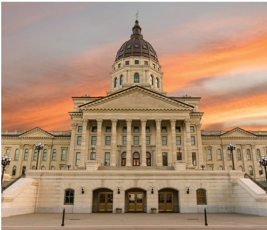
Kansas capitol building in Topeka, Kansas