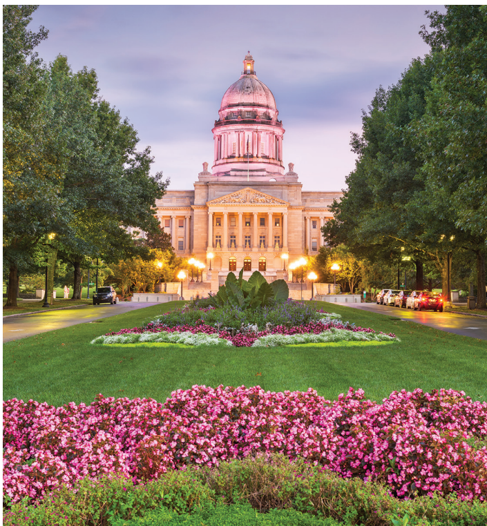
Kentucky capitol building in Frankfort, Kentucky