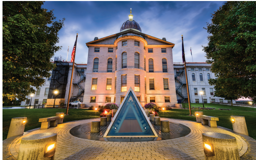
Maine State House in Augusta, Maine