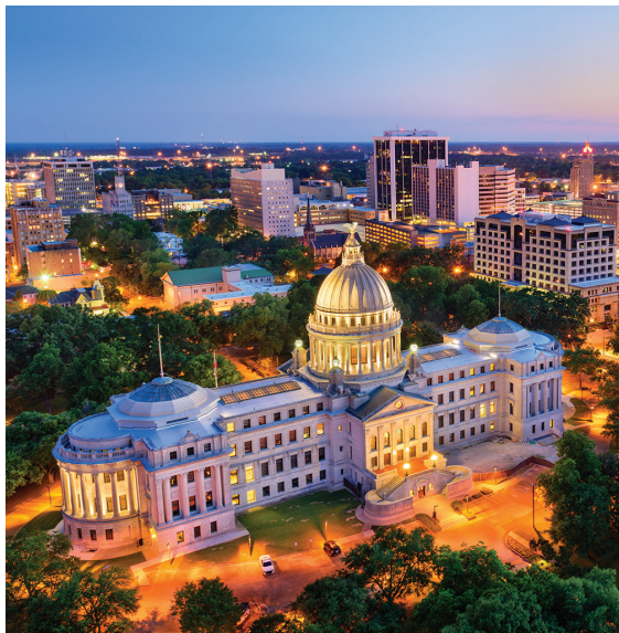
Jackson, Mississippi