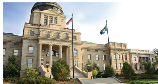
Montana State House in Helena, Montana

Previous Gov. Steve Bullock released his final budget proposal for the 2023 biennium on November 16th. Because Montana entered the COVID-19 pandemic in a historically strong fiscal position with maximum reserves, the governor's proposal balances the budget without raising taxes or making cuts to essential services that would be detrimental to public health, education, and efforts to recover from economic impacts caused by the virus, according to his office.