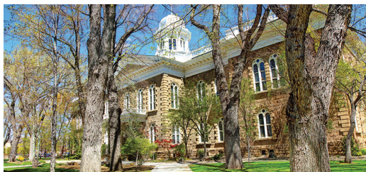
Nevada State House in Carson City, Nevada