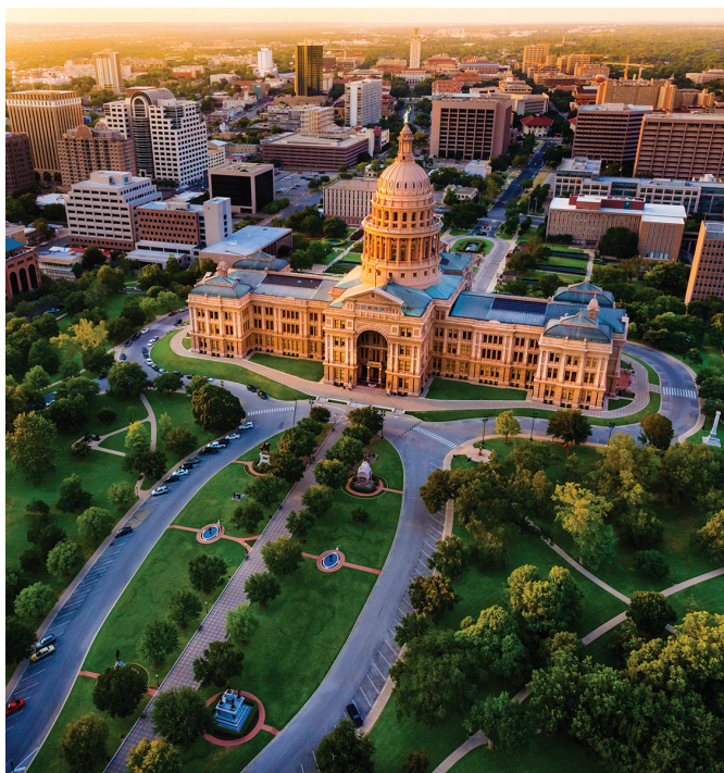
Austin, Texas

The Federal Reserve Bank of Dallas reported in November that Texas jobs grew at an annualized 3.6% in the third quarter, falling short of the national growth rate of 11.9%, but characterized overall employment contraction as mild. “Job growth in Texas has been broad-based since July, led by government, professional and business services, and the information sector,” the Fed reported. “Leisure and hospitality, which experienced the sharpest payroll drop at the onset of the pandemic, recorded steady growth, while energy jobs were added in September for the first time since April 2019. Among major Texas metros, Austin’s employment growth in August and September was strongest.”