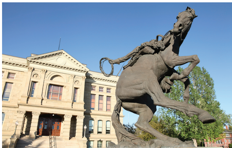
Cheyenne, Wyoming

O n Dec. 23, The Wyoming Business Council announced today that all CARES Act dollars allocated to the Endurance Fund have been fully expended, dedicated to paying applications from entities that did not previously receive COVID-19 Business Relief Program (BRP) awards. A total of 981 Wyoming businesses and nonprofits were paid $82.8 million from the Endurance Fund.