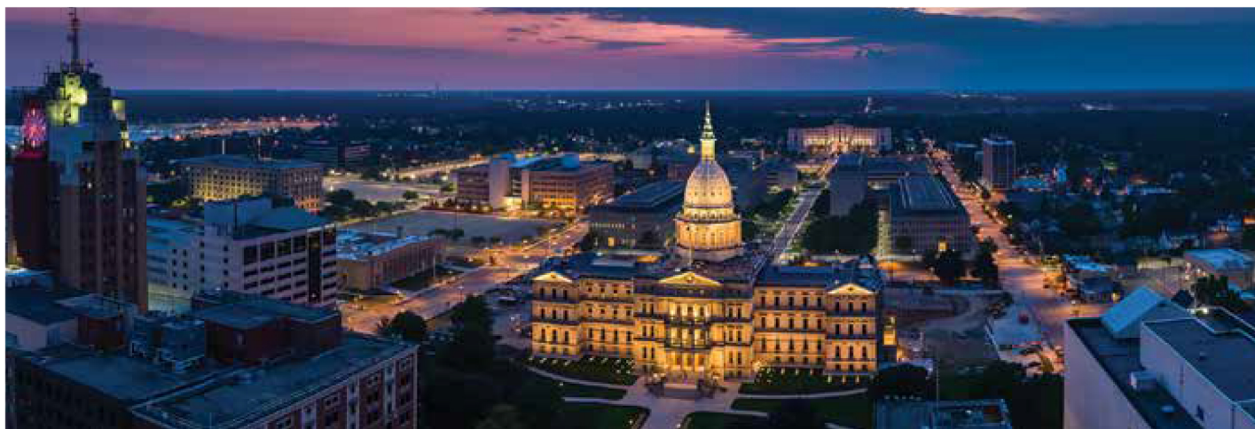
Lansing, Michigan

E Q United, a logistics provider and RV components manufacturer, is establishing new operations in the village of Cassopolis with support from the Michigan Strategic Fund. The project is expected to generate a total capital investment of $6.2 million and create up to 175 jobs, supported by a $350,000 Michigan Business Development Program performance-based grant. Michigan was chosen for the project over competing sites in Indiana.