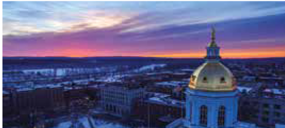
New Hampshire State House in Concord, New Hampshire

SB 85 establishes the Broadband Matching Grant Fund through the Department of Business and Economic Affairs and is to be funded with state appropriations, gifts, grants, donations, and available federal funds. Grants will be awarded to projects to expand broadband coverage. Through the COVID-19 Emergency Broadband Expansion Program, nearly $13 million was invested in critical broadband projects utilizing CARES Act funds to connect nearly 4,500 previously unserved properties.