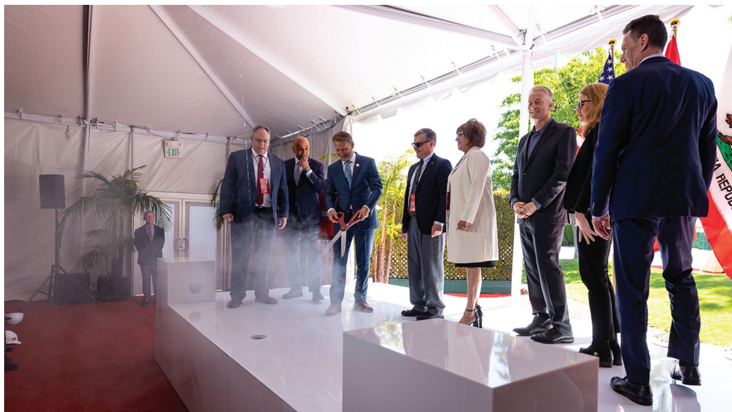
Officials of Air Products and World Energy mark the announcement of the expansion of World Energy’s sustainable fuels facility in Paramount, California.

A ir Products and Chemicals, based in Lehigh, Pennsylvania, is teaming up with Boston-based World Energy on a $2 billion expansion project of World Energy’s Sustainable Aviation Fuel (SAF) production and distribution hub in Paramount.