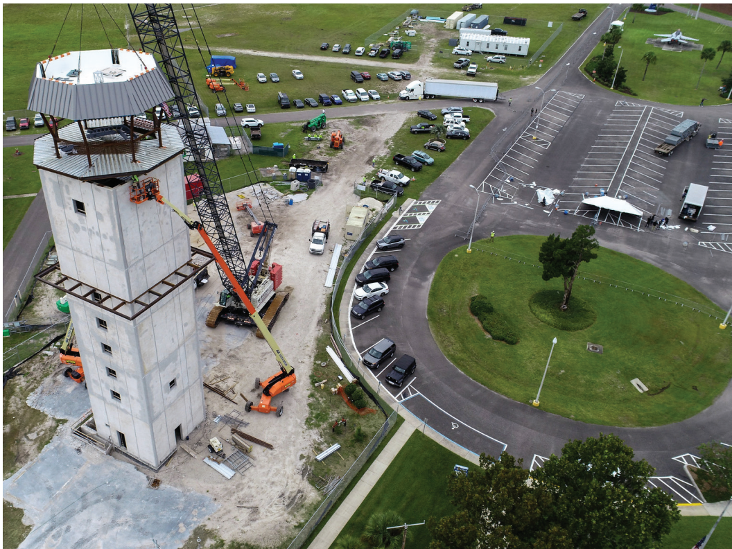
Tower construction at Jacksonville's Cecil Spaceport

B oeing's massive expansion at Cecil Airport on the west side of Jacksonville now includes plans for a $102 million hangar covering nearly 370,000 sq. ft. The project is an added component to Boeing's $156 million maintenance, repair and overhaul complex to open in 2023.