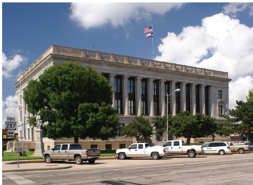
The Wilbarger County Courthouse in Vernon, Texas

A ir Products and Chemicals, based in Lehigh, Pennsylvania, and Arlington, Virginia-based AES Corporation, announced plans in December for a $4 billion green hydrogen production facility in Wilbarger County, northwest of Dallas-Fort Worth. The renewable power to hydrogen project is to include some 1.4 GW of wind and solar generation along with the capacity to produce over 200 metric tons per day of green hydrogen. That, the companies said in a release, will make it the largest green hydrogen producing facility in the United States.