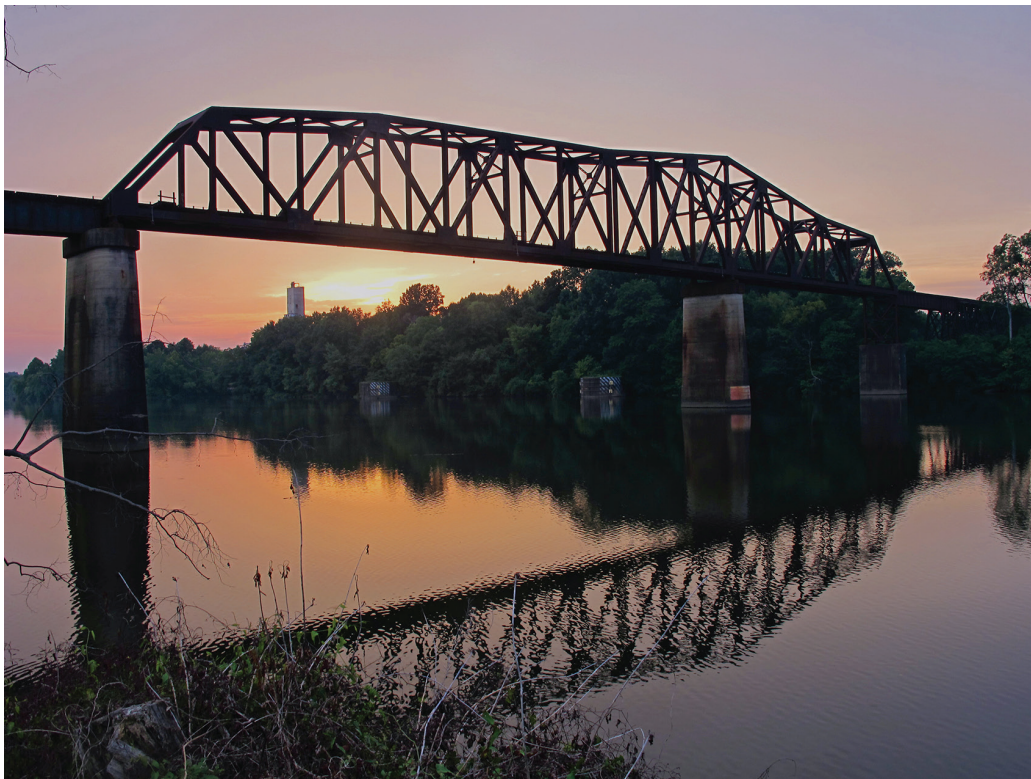
A classic train bridge spans the Black Warrior River in Tuscaloosa at sunset.