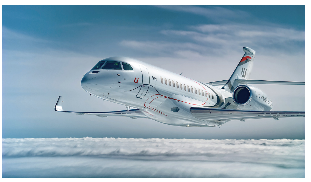
Dassault Falcon's 6X

assault Falcon announced plans in December for a $100 million expansion of its facility in Little Rock that's to create 800 new jobs. State officials say Gov. Sanders signaled support for the project during a meeting with Dassault U.S. and French leadership at the Paris International Air Show in June. At an announcement ceremony, Dassault officials said Little Rock had been selected for an expanded