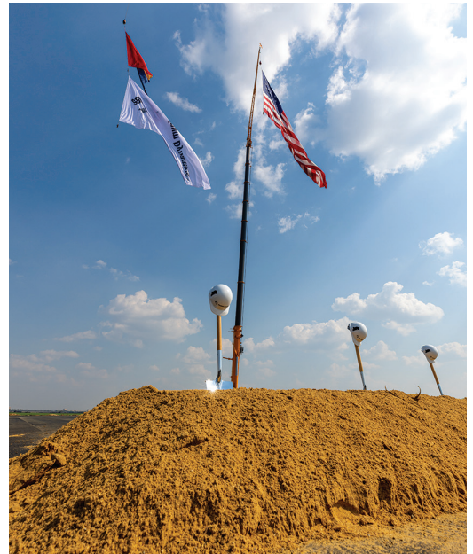
Steel Dynamics’ groundbreaking ceremony took place in Columbus, Mississippi, in March 2023.

As reported by Ron Starner in the Mississippi Development Guide 2023 produced by Site Selection publisher Conway Data, the Columbus site “was chosen for strategic reasons, including its proximity to one of SDI’s largest electric-arc-furnace steel mills, which will use a significant amount of the biocarbon as a replacement for anthracite. The site is also close to abundant fiber raw material resources in the region. Other pivotal location factors included ‘excellent logistics provided by on-site access to a Class I railroad, proximity to the major U.S. highway systems,