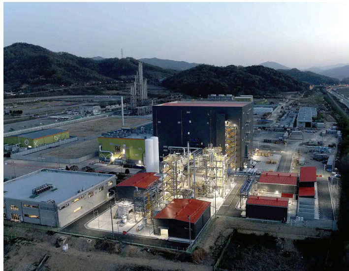
Group14’s site in Moses Lake

Based in Woodinville, Washington, and with manufacturing operations in South Korea, Group14 Technologies received a $100 million federal grant under the Bipartisan Infrastructure Law to build what the company bills as the world’s largest production site for advanced silicon battery materials in Moses Lake. The company’s flagship product is a silicon-carbon composite material designed for use in lithium-ion battery anodes. In September 2024, Group14 won an additional $200 million federal grant to build a silane gas plant in Moses Lake to supply its operation and others. Group14 — which requires abundant, reliable and sustainable electricity — cited the availability of clean, affordable hydropower as crucial to its decision to locate in Grant County. Drawing upon the county-owned Wanapum and Priest Rapids Dams, the Grant County Public Utility District, can deliver electricity in the range of 3.2 cents per kilowatt-hour. That’s less than half the national average.